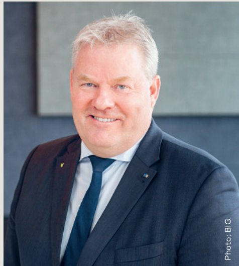
Minister for Nordic Co-operation Sigurður Ingi Jóhannsson