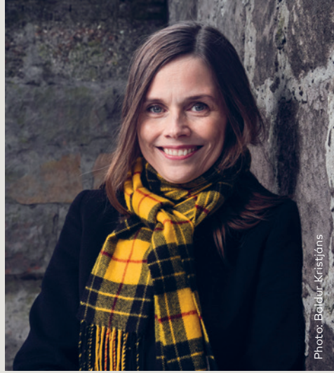
Prime Minister Katrín Jakobsdóttir